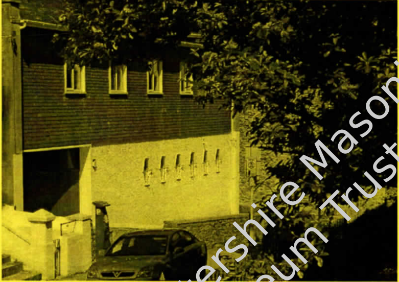
Mount Edgcombe Masonic Hall Stradel Road Plymouth