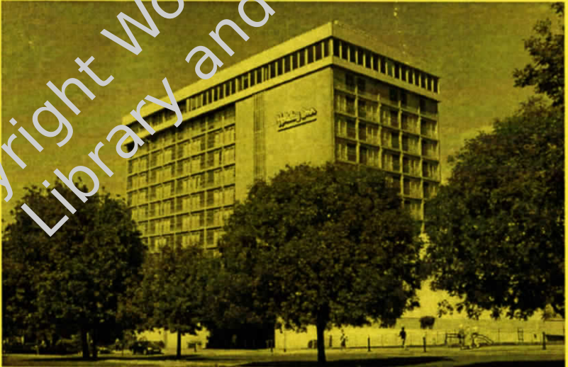
Holiday Inn Armada Way Plymouth